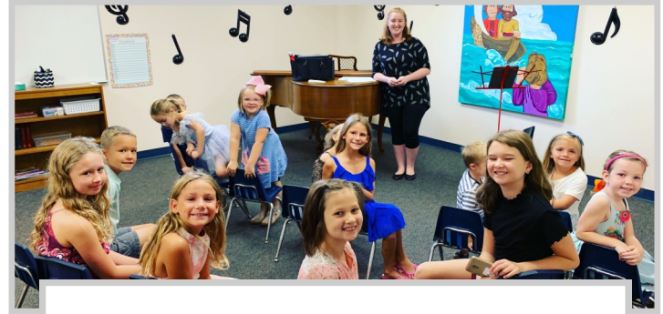
We had an amazing turnout at Children's Choir on Kick-off Sunday!

Trunk or Treat: October 26, 4:00pm-5:00pm Bring your little ones in costume or trick or treat from car to car in this safe spin on traditional Beggar's Night! The event will be held in the lower parking lot of the church. There will be face painting and plenty of apple cider available!